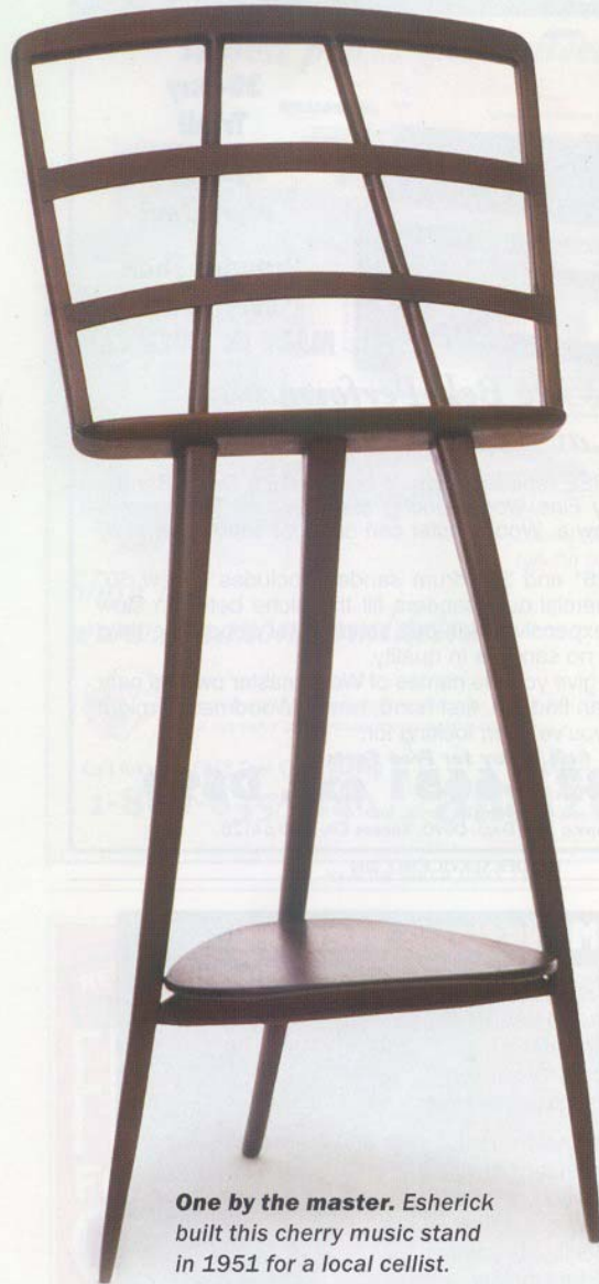
One by the master. Esherick built this cherry music stand in 1951 for a local cellist.